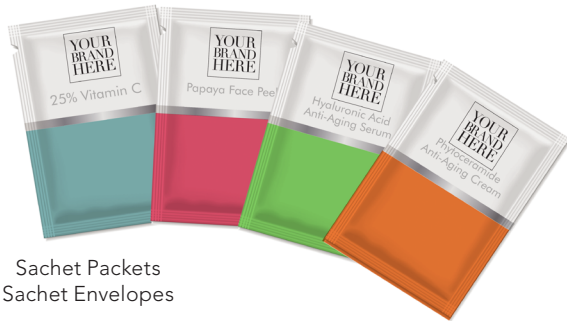
Sachet Packets Sachet Envelopes